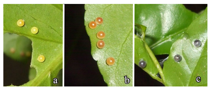
Fig. 1. Colour variation of P. schmeltzi eggs with age in the enclosure. Newly laid eggs (a), half way through egg stage (b) and eggs close to hatching (c).

stage on which morphological observations are based and the measurements are given in Table 1. We recorded variation in the colour and other morphological characteristics, duration of pupa stage and time of day the adult emerged. Fecundity of adults was estimated by counting eggs deposited in cage and oviposition rates were calculated by number of eggs laid daily for the first five days of oviposition. The number of larval instars was assessed as well as duration of individual instars, and the overall growth rate. Courtship and mating behaviour including mating frequency were observed. Longevity of adults and their interactions in a closed environment in cage were observed. Adult butterflies were observed in various behaviors such as feeding, coupling, chasing and oviposition. The camera used to take photos in the cage was a FujiFilm (FinePix A820) digital camera with 8.3 Mega Pixel recording and 4X Optical Zoom.