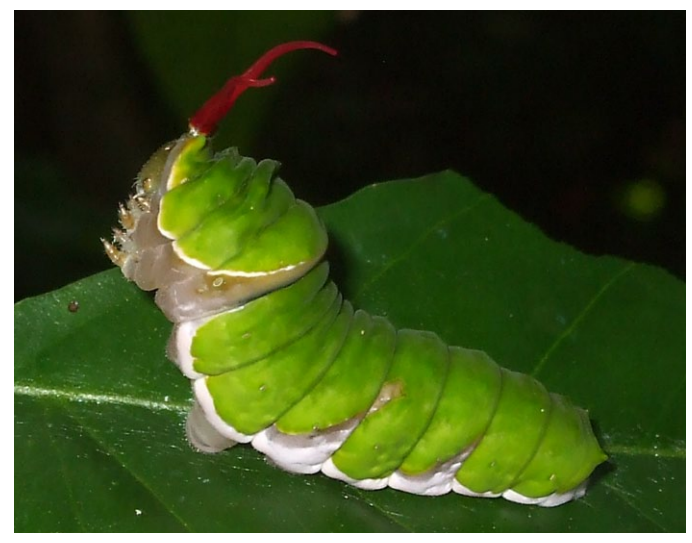
Fig. 4. Defensive posture of fifth instar larvae of P. schmeltzi in the enclosure.

high flight activity and low population density. Fertility per day of P. schmeltzi in captivity was higher than that under natural conditions as revealed by field data. The number of eggs laid on individual larval host plants ranged from 4 to 36.