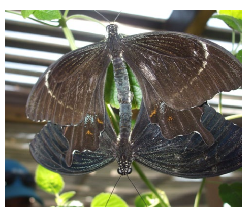
Fig. 5. Copulation of P. schmeltzi.