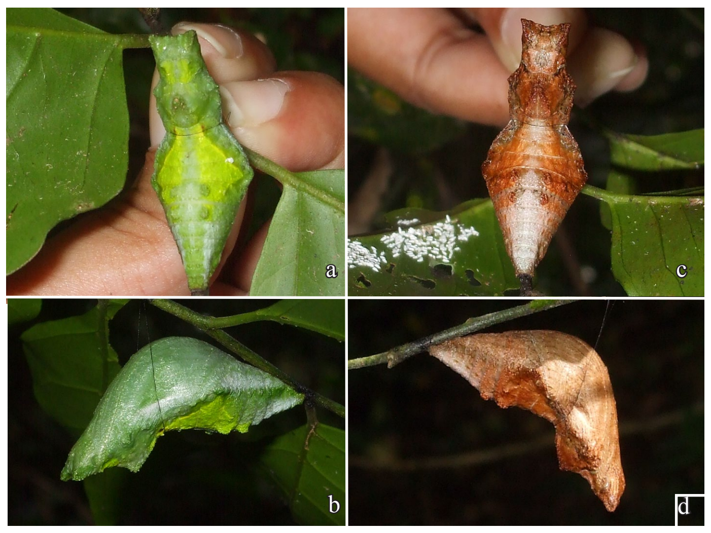
Fig. 3. Dorsal (a) and lateral (b) view of the green pupae and dorsal (c) and lateral (d) view of the brown pupae of P. schmeltzi on the M. minutum plant in the enclosure.

Copulation. Breeding studies of P. machaon bairdii (Thompson, 2003; Tkacheva et al., 2005) suggested that swallowtails do not readily pair by themselves in captivity, so hand-pairing and force-feeding is advised. However, no hand-pairing or force-feeding was needed in this study as the cage size used was adequate and the cage design was suitable for butterflies to engage in normal activities as close to those in natural habitat as possible.