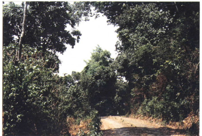
Fig. 1. Road leading to Los Mazos microwave tower at about 1400m, above Puerto Los Mazos, on Hwy. 80, SW of Autlán, Jalisco, Mexico (Sierra de Manantlán).