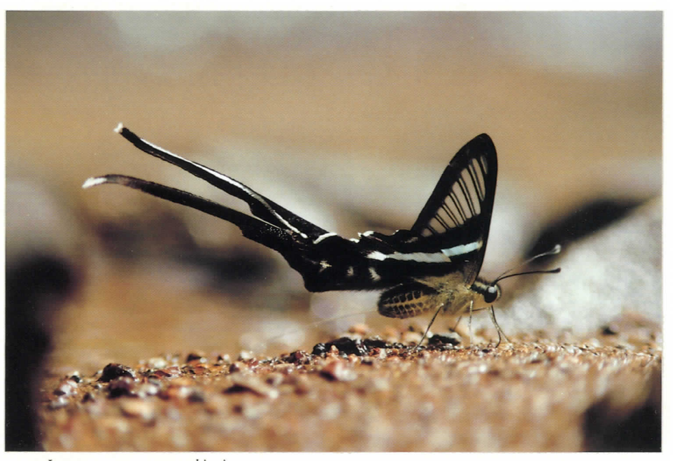
Lamproptera meges akirai (Papilionidae) Indonesia (Sulawesi) (J. J. Young)