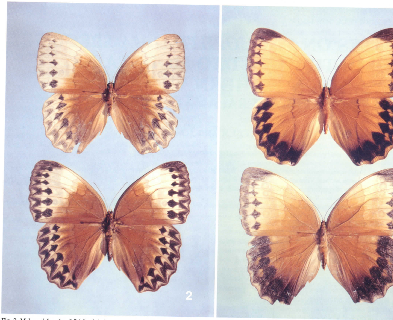
Fig. 2. Male and female of Stichophthalma louisa fruhstorferi from the Tam Dao Mts., northern Vietnam. Fig. 3. Male and female of Stichophthalma howqua suffusa from the Tam Dao Mts., northern Vietnam.