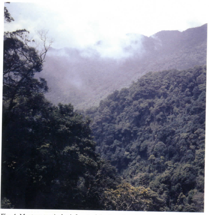
Fig. 4. Montane tropical rainforest of the Tam Dao Mts., northern Vietnam.