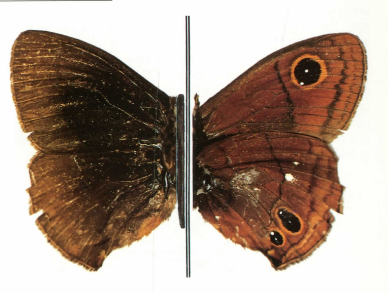
Fig. 1. Upper surface (left) and under surface (right), Calisto tasajera male, Valle de Bao (1800 m), north slope of Pico Duarte, Santiago Province, Dominican Republic.

Gonzalez, Schwartz and Wetherbee (1991) described C. tasajera from a series of specimens from San Juan Province, Dominican Republic, taken on Loma de Tasajera in fire-charred grassland at 2141m. They also reported the species from the base of Loma la Diferencia, 1750-2300m on the border with Santiago Province and from Santiago Province on Pico Platico, 1200-2500m. These localities are not accessible by vehicular traffic. Specimens reported in the present paper were obtained while the