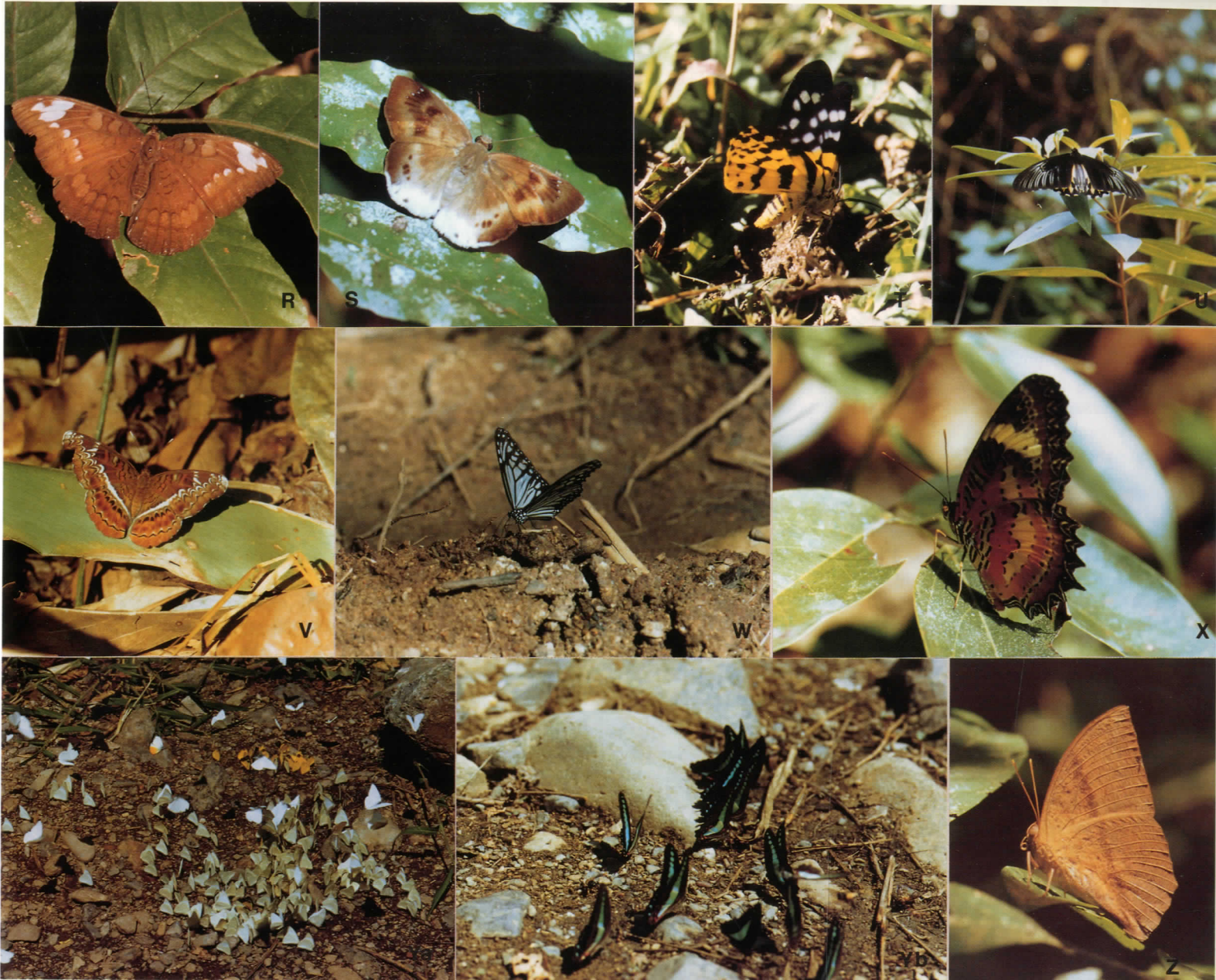
PLATE 2 (this page and opposite page). See text for species names (page 82).

exposing a calcareous, slightly sulphurized ground with a few dwarf trees surviving. It is possible to explore interesting caves at the top of the T trail, while the P trail leads to the lovely Bang Tio waterfall. Butterflies belonging to the genera Graphium , Papilio , Troides , and Appias usually are found along the wider trails: A and J. Khao Noi Chuchi guard camp is equipped to welcome visiting naturalists, with inexpensive accomodation provided by the park authorities. Special attractions at Khao Noi Chuchi include a natural pool of crystal blue water, where after a day of exploring, one can refresh oneself (and remove the leeches!).