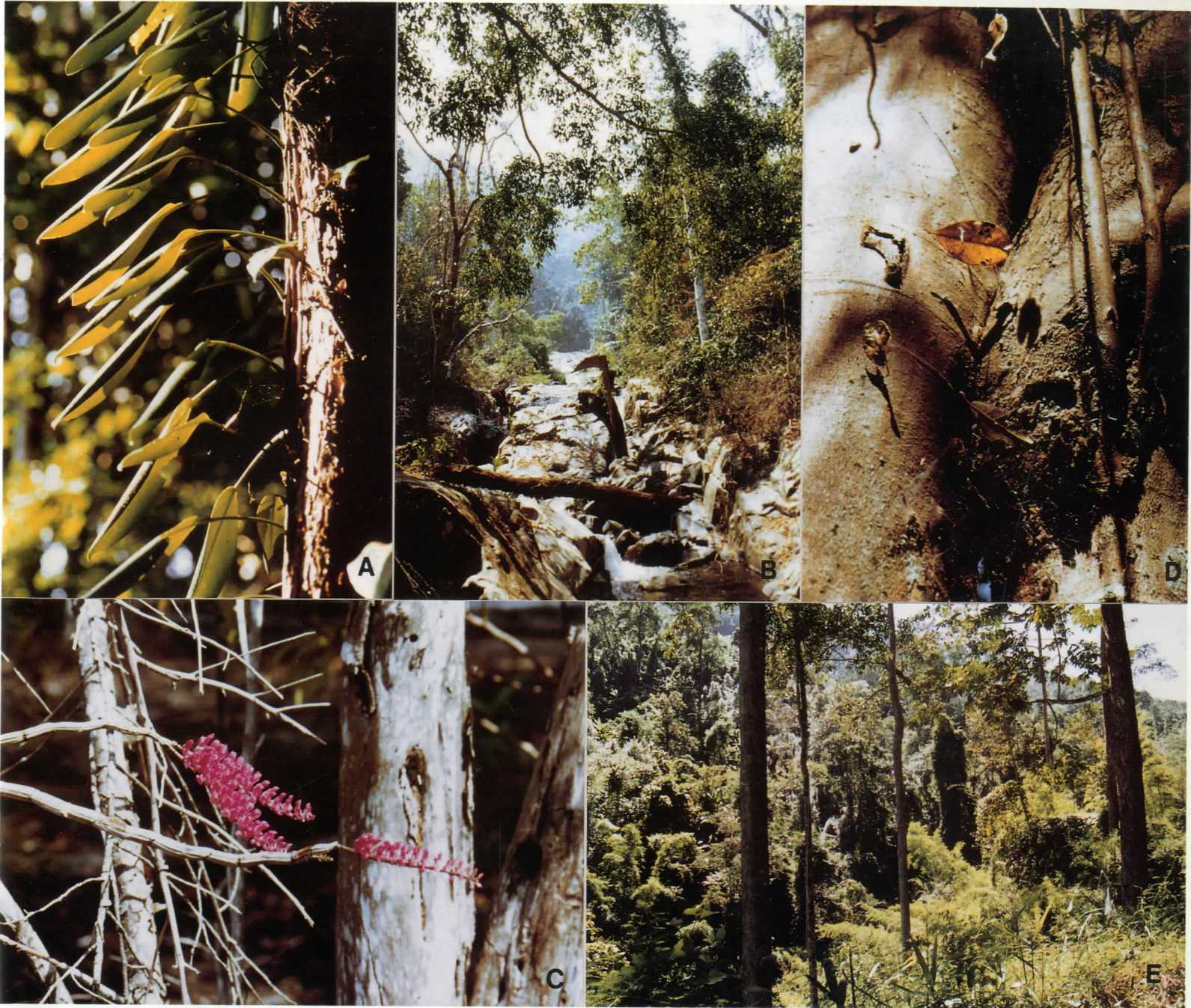
PLATE 1. Forest scenes in Thailand: A, C-D) Khao Noi Chuchi; B) Khao Sai Dao; E) Sopkai.