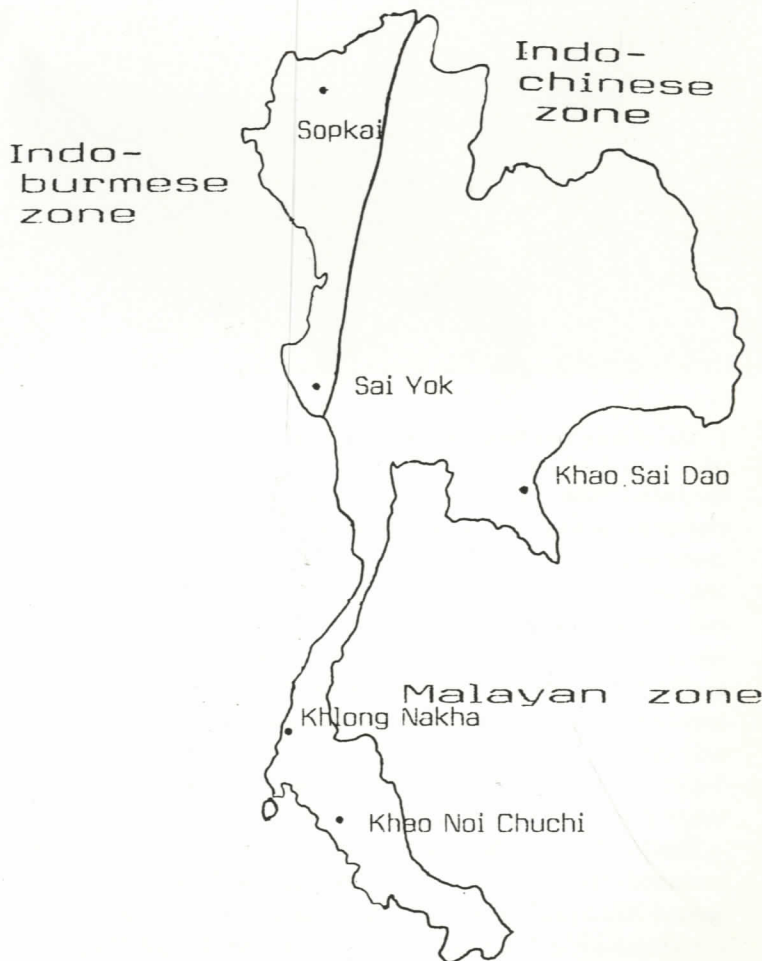
1. Zoogeographical subregions of Thailand and the five national parks and forest reserves visited.

Khao Noi Chuchi (Krabi Prov.) and Khlong Nakha (Ranong Prov.) lie in the Malayan zone. The typical feature of the fauna of this zone is a great diversity of species in the families Amathusiidae and Lycaenidae, especially the Arhopala group of lycaenid genera. The predominance of the Malayan elements ends approximately at 10°N latitude on the Isthmus of Kra. North of this area extends the Indo-Chinese zone, embracing the center and the east of Thailand. The fauna of Khao Sai Dao National Park, situated a few kilometers from the Cambodian border, belongs to that zone. Its typical representatives include Stichophthalma cambodia (Hewitson), Prioneris thestylis (Double-day), and Atrophaneura laos ((Riley & Godfrey). The fauna of Nam Tok Sai Yok, which is situated in the Erawan National Park, 200km west of Bangkok, is transitional between the faunas of