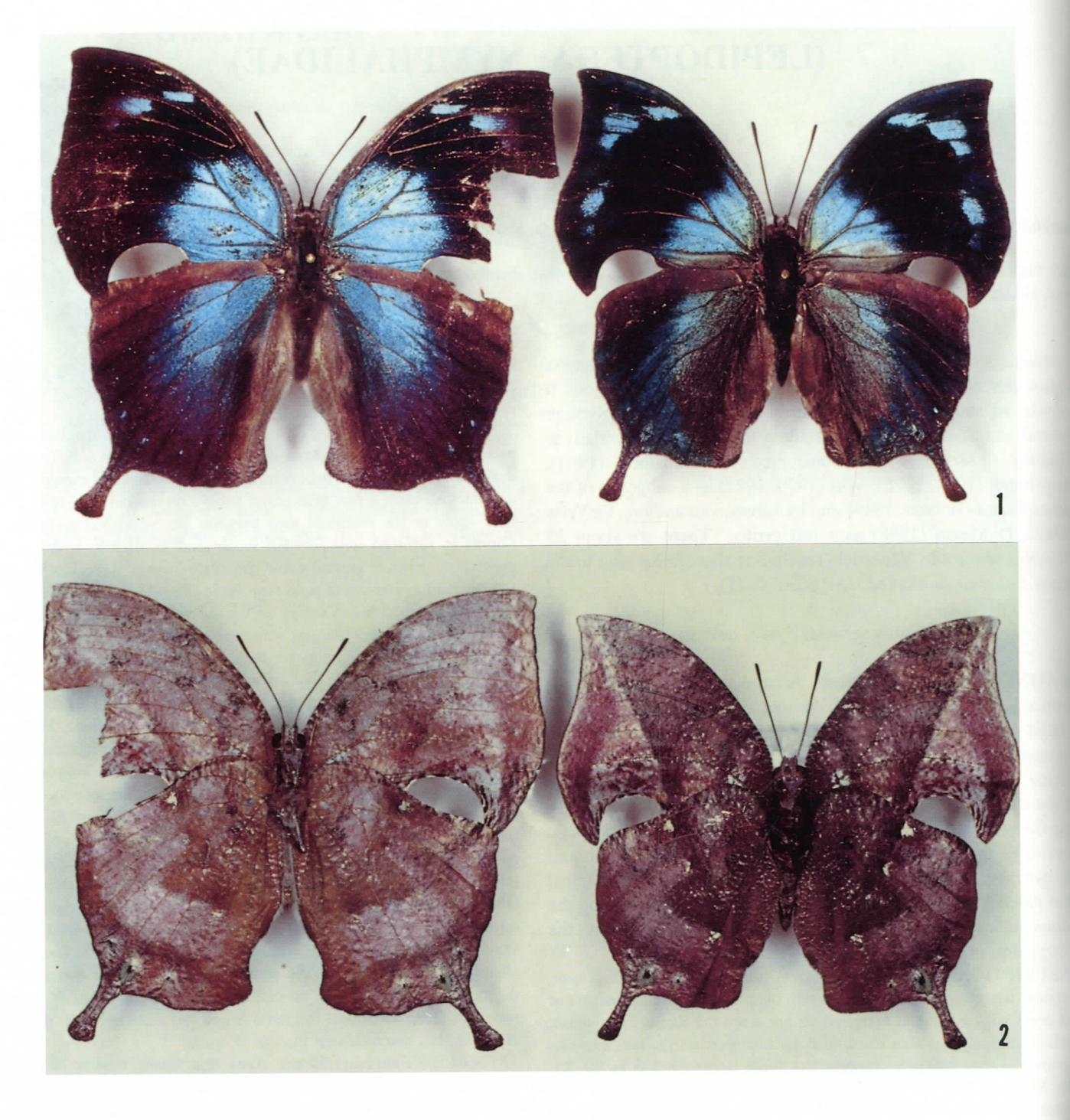
Fig. 1-2. Memphis salinasi, ♂ (right) and ♀ (left), Venezuela: 1. Dorsum. 2. Venter.

area, toward the tornus graduatly turning blakish; a few blue scales visible as far as the postmedial area; blue spots aligned between the veins in the marginal area. Venter : ground color chestnut, almost uniform; 3 small black patches in the discal cell, a white irregular patch on the costal margin in the medial area, white scales numerous on the anal margin; white spots aligned between the veins in the marginal area; the spots on the base of the tail doubled with additional black dots and pupiled with grey-greenish patches.