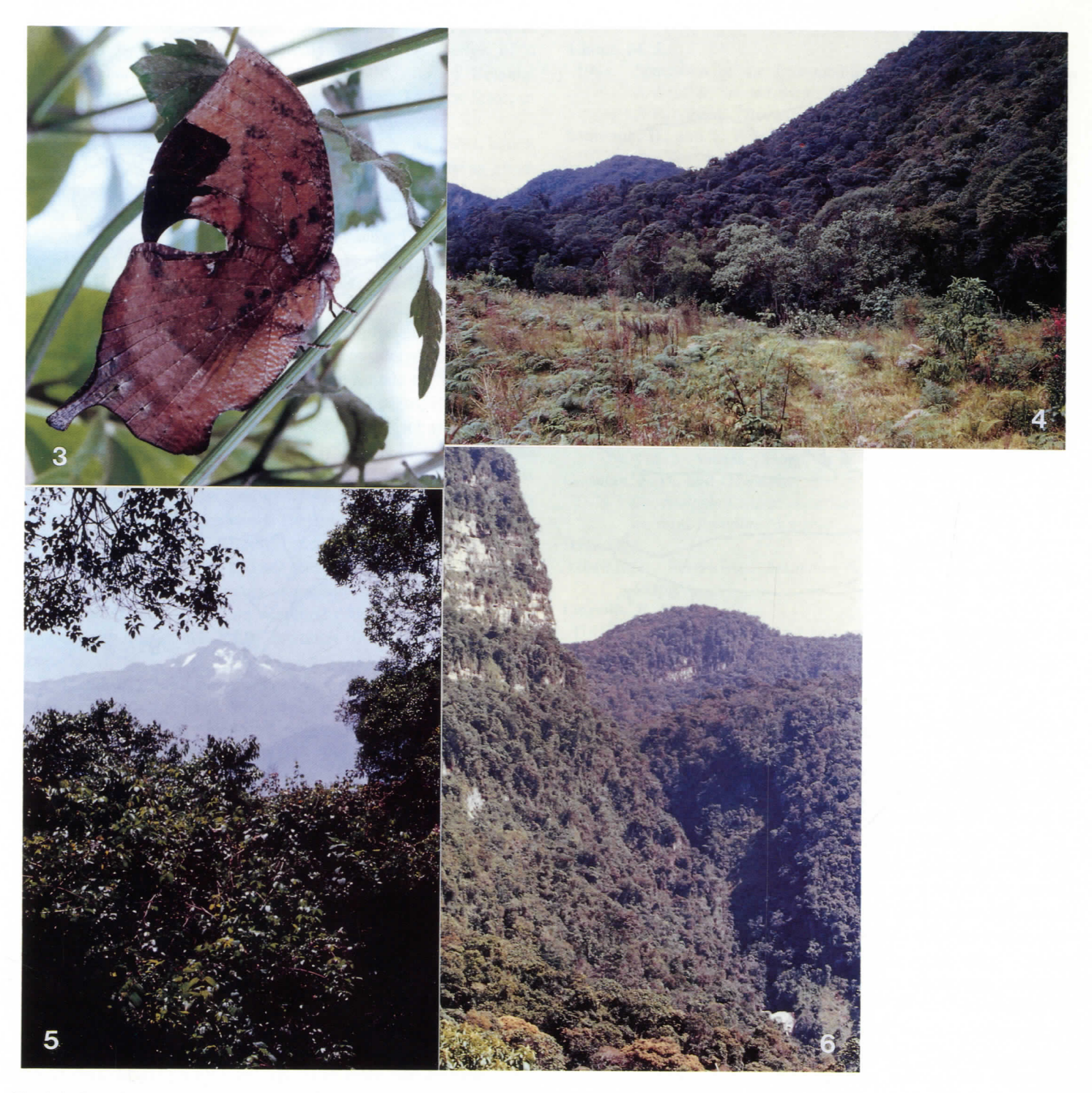
Fig. 3-6. Memphis salinasi: 3. Female in nature, Venezuela. 4. Type locality of M. salinasi (Qda. La Cuesta). 5. Pico Bolívar (5001m), seen from the third site of M. salinasi (Monte Zerpa). 6. Second site of M. salinasi (La Chorrera).

Sep 1991, T. Pyrcz, (to be deposited in Museo de Entomologia, UCV, Maracay). Allotype 9: locality and altitude as above, 6 Dec 1991, T. Pyrcz, (author's collection).