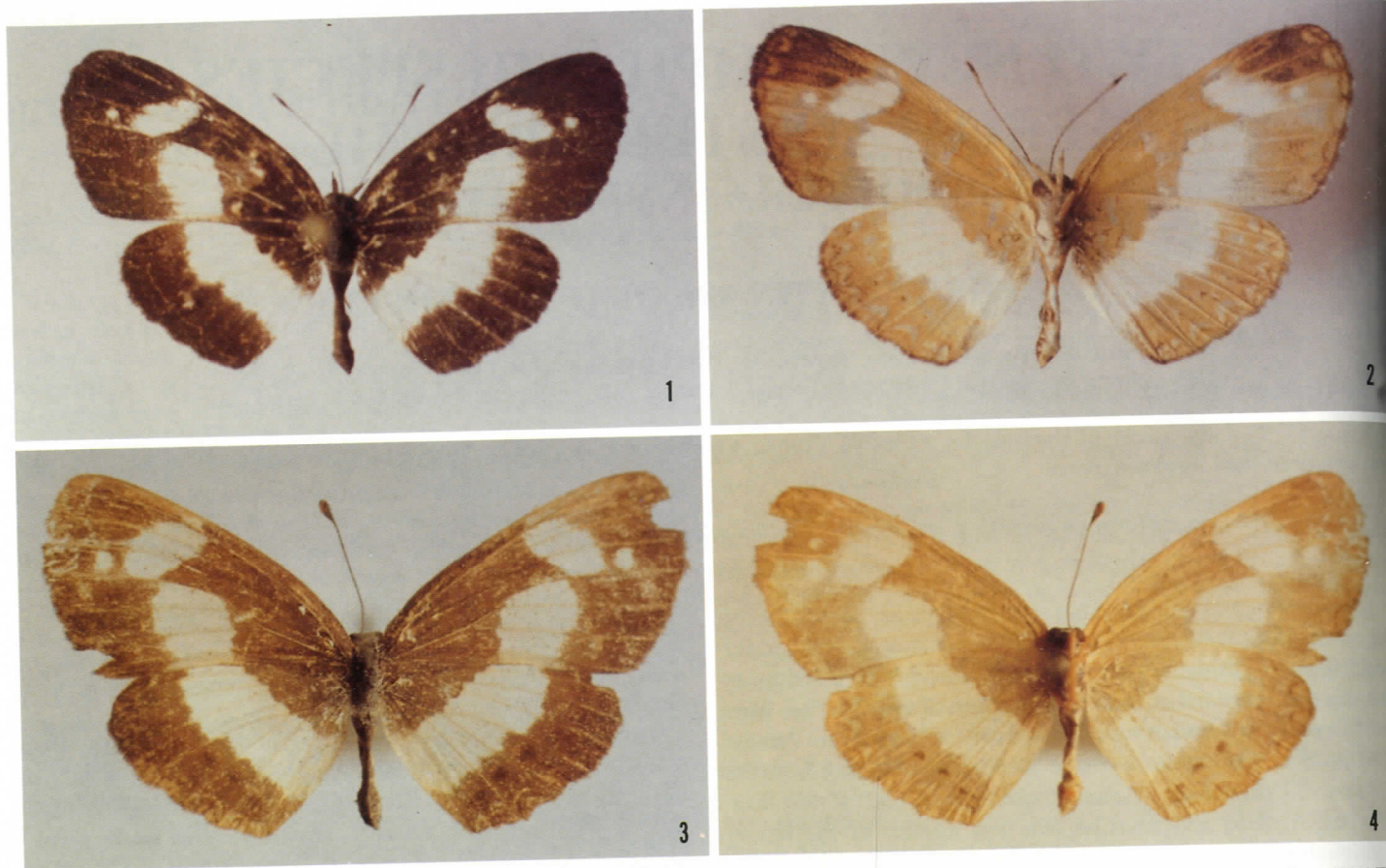
Fig. 1-4. Castilia schmitzorum Austin & Mielke: 1. Holotype ♂, dorsal surface (data in text). 2. Holotype ♂, ventral surface. 3. Paratype ♀, dorsal surface (BRAZIL: Rondonia; Jaru, Oct 1977, leg. H. Ebert). 4. Paratype ♀, ventral surface (same specimen as Fig. 3).

REMARKS. — Superficially, Castilia schmitzorum resembles two taxa which are represented by their single holotype males, Phyciodes fontus Hall from Guyana and Phyciodes rima Hall from Surinam. Higgins (1981) placed the former in the genus Dagon and thought the latter might be a Telenassa although he could not examine their genitalia. The present species clearly belongs to neither genus; the male genitalia place it in Castilia . Both P. fontus and P. rima were illustrated in color by D'Abrera (1987). The pale bands on those species are narrow (very narrow on P. fontus ) and yellowish; these appear to be crossed by darker veins at least on the venter (the bands are broad and white on C. schmitzorum and the veins are also white-scaled). The lunules on the venter are more strongly angled than on C. schmitzorum , the dark spots proximal to the lunules on the hindwing are haloed with brown, and the basal lines are prominent unlike the unhaloed spots and very faintly marked wing bases on C. schmitzorum .