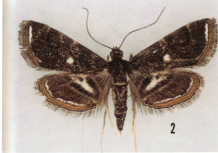
Figs. 1-2. Parthenodes okinawanus new sp.- 1. Male holotype (left); 2. Female paratype (right).

The genus Parthenodes Guenée contains some 40 species in the world, being especially rich in species in the subtropical and tropical regions. Until now only 4 species of this genus have been recorded from Japan (Yoshiyasu, 1985). We will newly describe the 5th species of the genus from the Ryukyus, with comparison with the closely related species, particularly Parthenodes fuscalis Yoshiyasu. The terminology of the wings and genitalia was referred to in Yoshiyasu (1985).