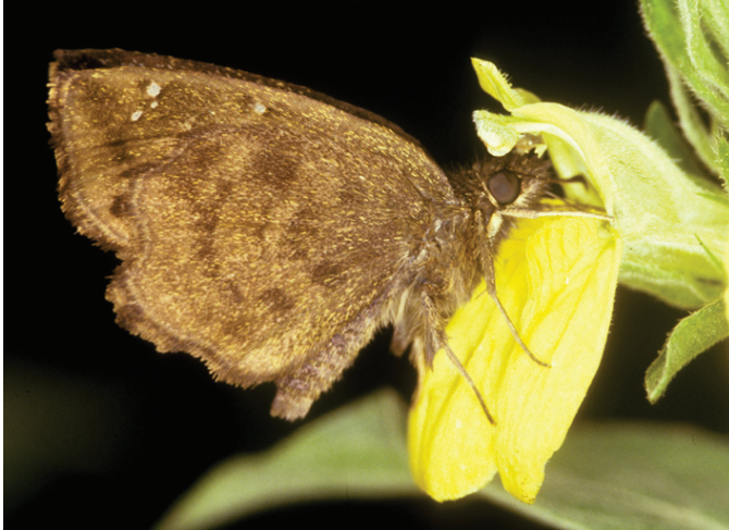
Fig. 3. Two males of Eretis artorius feeding on Justicia flava (Acanthaceae) in Kakamega Forest. It is quite unusual to see either sex sitting with the wings folded as in the picture, which fortuitously is the actual holotype.