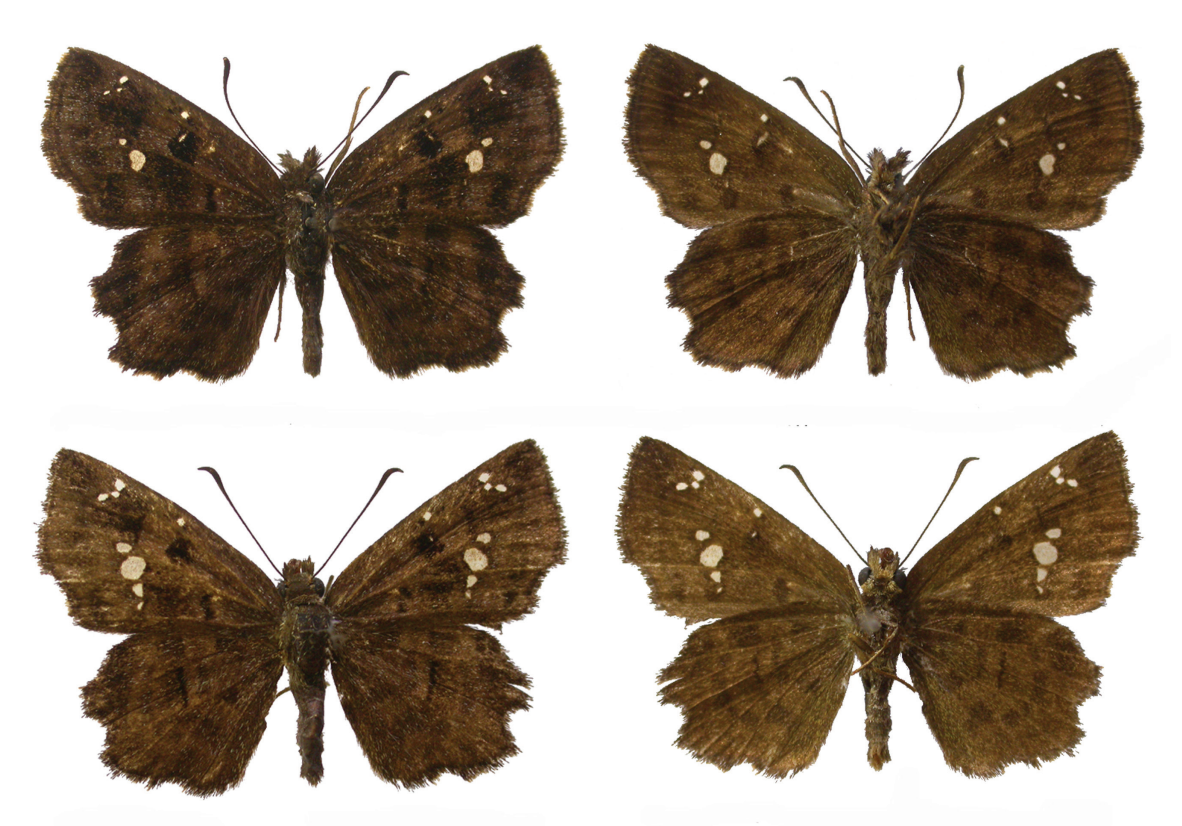
Fig. 1. Top: The holotype of Eretis artorius from Kakamega, Kenya (recto and verso); Below: A female paratype also from Kakamega (recto and verso).

the darkest upperside markings are fully visible and are mostly reduced in size.