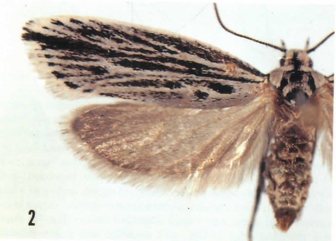
Fig. 1-2. Ethmia kutisi Heppner, new sp .: 1. Male paratype (Belleview, Marion Co.); 2. Female allotype (Belleview, Marion Co.).

elongated extensions somewhat longer than anellar plates; aedeagus (Fig. 3a) convex, with a bulbous phallobase and long ductus; cornutus elongated and thin, but indistinct.