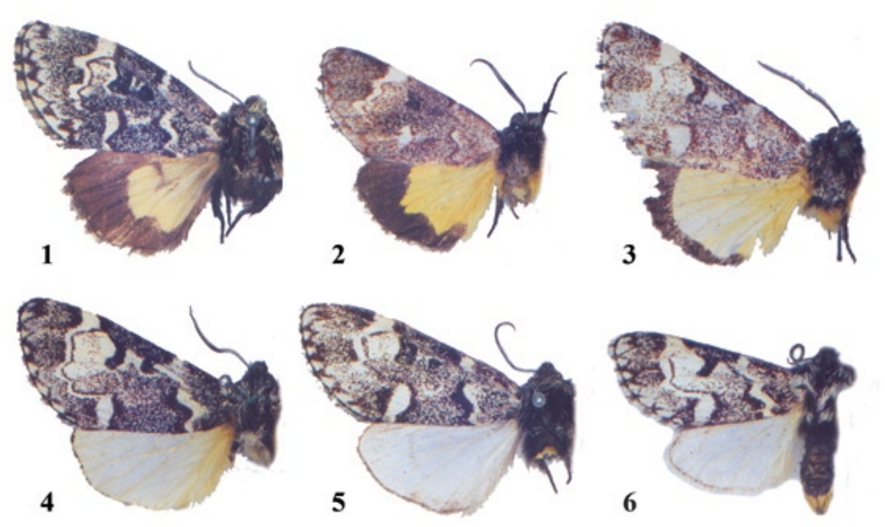
Figs. 1-6. Clemira adults (right wings removed). 1) magnifica lectotype female (Brazil); 2) hilsingeri male (Argentina); 3) schausi male (Argentina); 4) dolens male (Peru); trita male (Peru); sororcula holotype male (Bolivia).