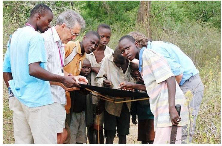
Fig. 3. Work with the beating tray. Sharp-eyed locals give their assistance! (Photo: Helen Fewster).

important for its own sake, but since Acacia woodlands often abut agricultural areas or are 'manicured' as gardens (e.g. around Lake Naivasha), knowledge of life histories can indicate when a species' primary host plant may be a wild tree rather than a cultivated legume. This woodland biotope is threatened by increasing population pressure with the associated demand for firewood, and so an appreciation of its biodiversity potential is important, before it is too late.