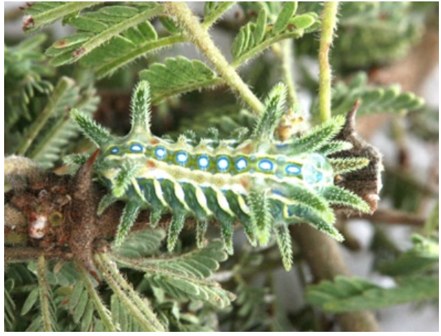
Fig. 2. Coenobasis farouki (Limacodidae).