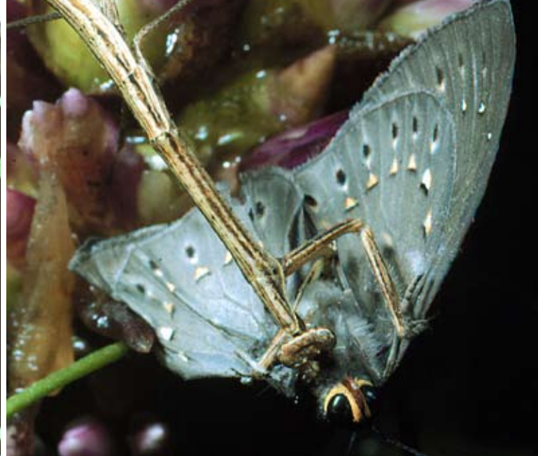
Fig. 1. An adult Eurybia elvina being eaten by a praying mantis. In the backgrund is an inflorescence of the hostplant Calathea latifolia.