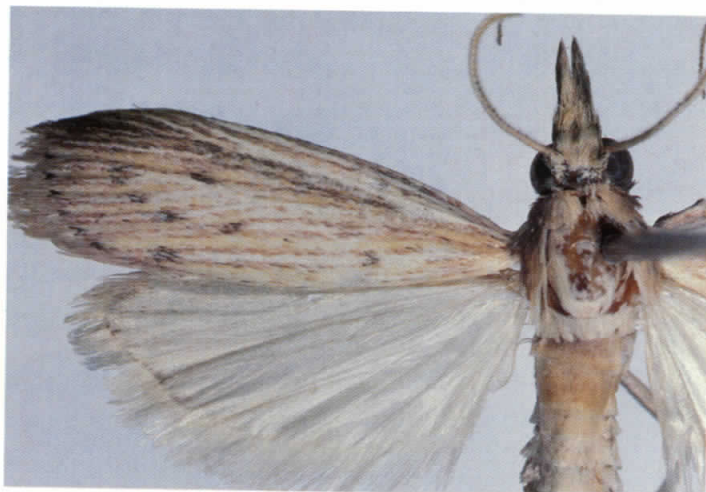
Fig. 1. Adult ♂, 19 Jan. 1968 specimen. Forewing radius = 9mm.

Ematheudes is primarily Ethiopian with over two dozen African species, many of them undescribed. The type species ranges over southern Europe and the Mediterranean region and the genus extends into Asia, where it has been less well studied. True Ematheudes is unknown from the Western Hemisphere. The following brief characterization of the genus is somewhat tentative pending completion of my studies of the African Peo-