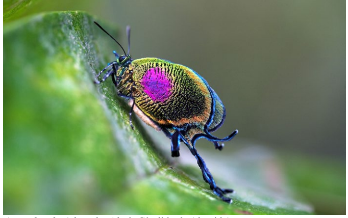
Arcas ducalis

Water droplets sparkle on the wings of the skipper Pyrgus orcus and sunlight picks out the translucent spots of the ithomiine Pseudoscada erruca , imbibing protective chemicals from an Asteraceae flower. I do not know enough about Lepidoptera in Brazil to judge how rare are the figured species, but certainly there were many that I have never seen alive, and I savored every image in the book.