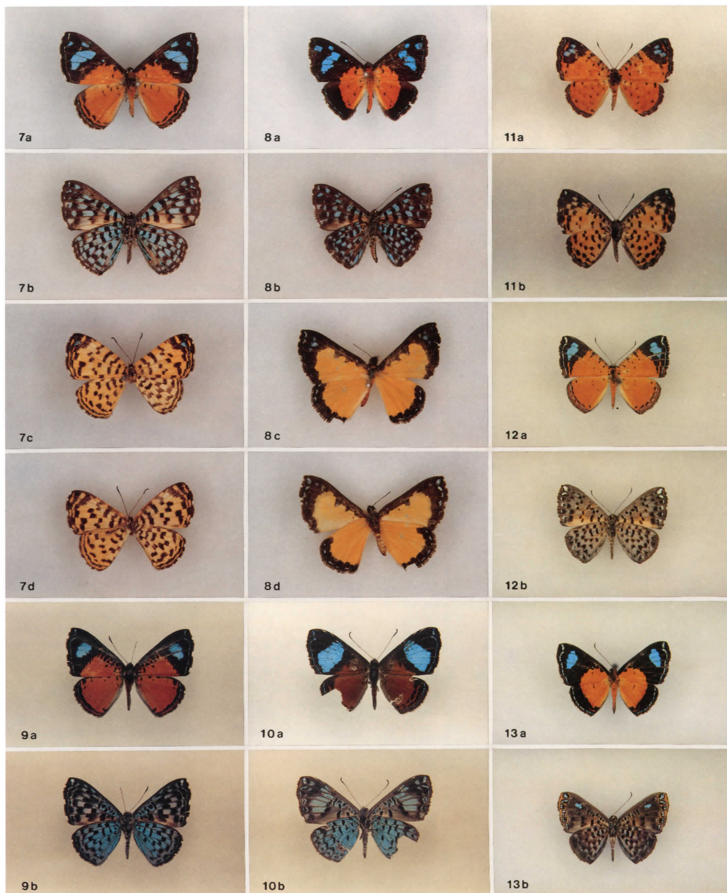
Fig. 7-13. Type specimens: 7. A. pulchra , type male: a) recto; b) verso. Type female: c) recto; d) verso. 8. A. sticheli , type male: a) recto; b) verso. Type female: c) recto; d) verso. 9. A. natalita n. sp., holotype male: a) recto; b) verso. 10. A. caelestina n. sp., holotype male: a) recto; b) verso. 11. A. aparamilla n. sp., holotype male: a) recto; b) verso. 12. A. celata n. sp., holotype male: a) recto; b) verso. 13. A. bonita n. sp., holotype male: a) recto; b) verso.