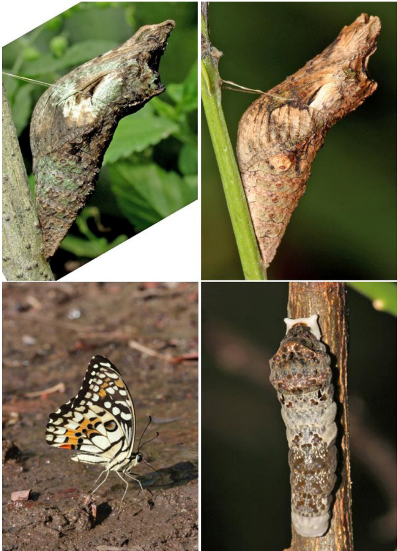
Fig. 3. Papilio demoleus pupa (top left) and Heraclides andraemon pupa (top right) and 5th instar larva (bottom right). Adult male P. demoleus puddling at Jardín de Helechos near the city of Santiago de Cuba.